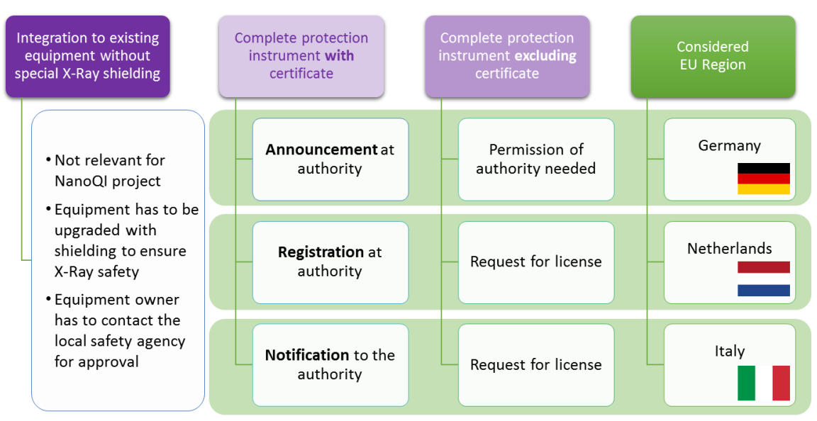
Figure 2: Decision tree for approval a XRD/XRR characterization device